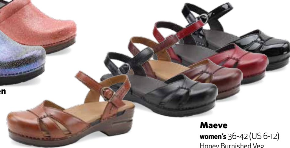
Maeve women's 36-42 (US 6-12) Honey Burnished Veg Black Burnished Veg Brown Burnished Veg Ruby Burnished Veg Black Patent