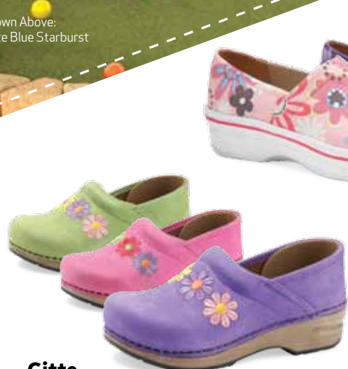
Gitte kids' 26-34 (US 8.5-4) Lime Nubuck Fuschia Nubuck Lavender Nubuck