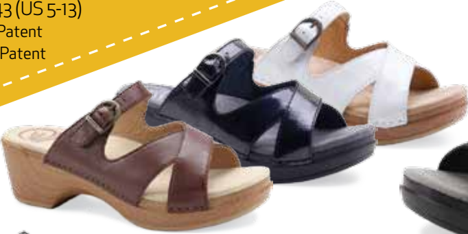
Sela women's 35-43 (US 5-13) Brown Pull-up Black Crinkle Patent White Crinkle Patent Black Pull-up

Lightweight outsoles and pillow soft insoles