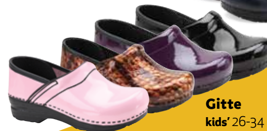
Gitte kids' 26-34 (US 8.5-4) Bubblegum Patent Pink Patent Tiger's Eye Patent Purple Patent Black Patent Black Full Grain Mocha Full Grain Indigo Full Grain