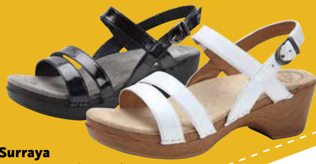
Surraya women's 35-43 (US 5-13) Black Crinkle Patent White Crinkle Patent

Lightweight outsoles and pillow soft insoles