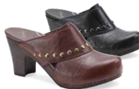
Rudy women's 36-42 (US 6-12) Brown Scrunched Full Grain Black Scrunched Full Grain