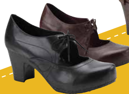
Rory women's 36-42 (US 6-12) Black Full Grain Brown Scrunched Full Grain