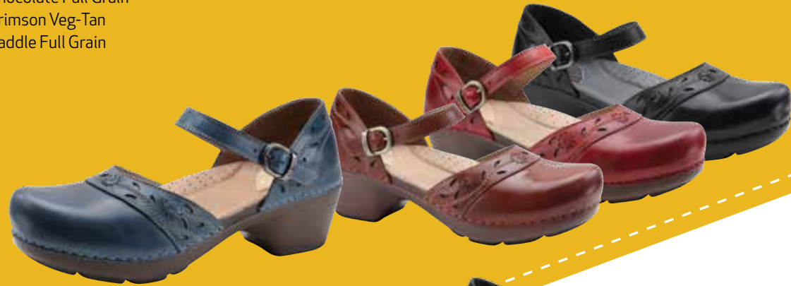
Stefanie women's 36-42 (US 6-12) Denim Veg-Tan Saddle Full Grain Crimson Veg-Tan Black Full Grain