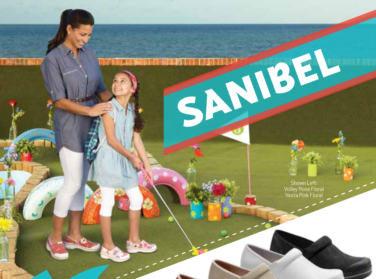
Shown Left: Volley Rose Floral Vesta Pink Floral

* SAY HELLO TO SANIBEL Don't let its fun personality fool you, the Sanibel collection features top quality construction and performance features that deliver serious Danskø comfort.