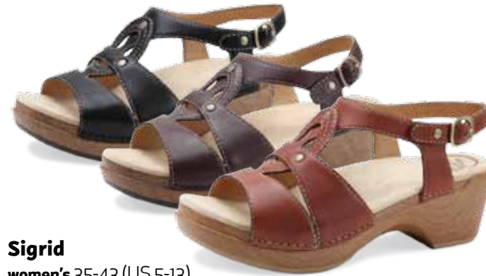
Sigrid women's 35-43 (US 5-13) Black Waxy Java Waxy Brandy Waxy