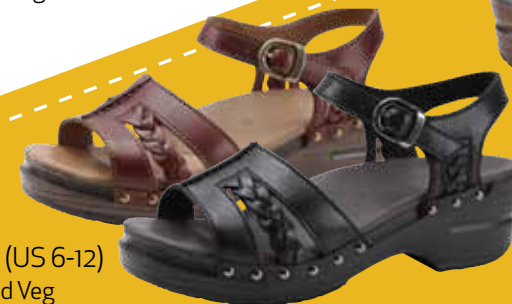
Micki women's 36-42 (US 6-12) Brown Burnished Veg Black Burnished Veg

Shown Above: Professional Iridescent Blue Shagreen