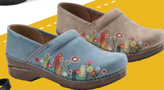
Professional Embroidered women's 36-42 (US 6-12) Blue Earthy Buck Oatmeal Earthy Buck