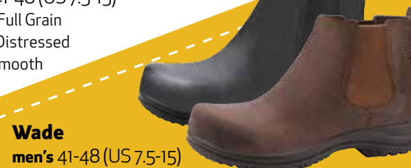
Wade men's 41-48 (US 7.5-15) Black Tumbled Brown Oiled Nubuck