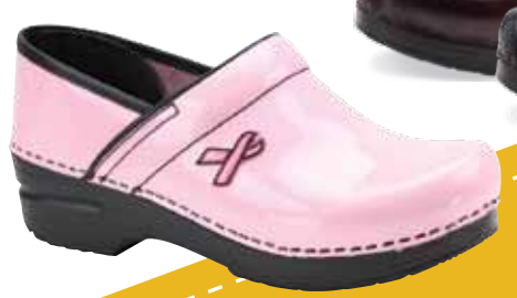
Professional Pink Ribbon women's 35-43 (US 5-13) Pink Patent