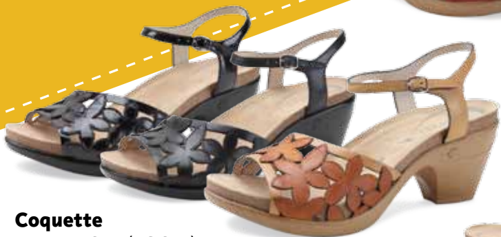
Coquette women's 36-42 (US 6-12) Black Patent Black Full Grain Amber/Biscotti Full Grain