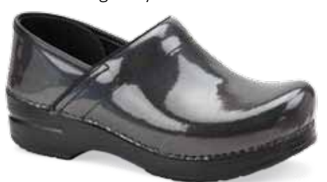
Professional Prism women's 36-42 (US 6-12) Grey Prism Patent