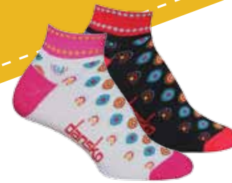
Orbit Ankle women's COOLMAX® EcoMade Black White