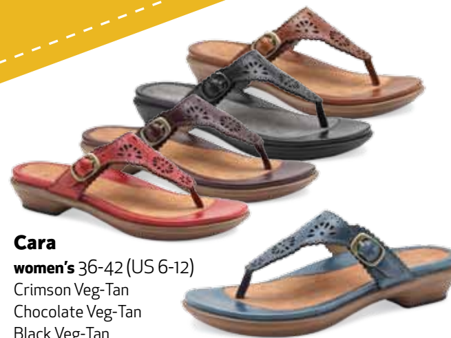
Cara women's 36-42 (US 6-12) Crimson Veg-Tan Chocolate Veg-Tan Black Veg-Tan Amber Veg-Tan Denim Veg-Tan