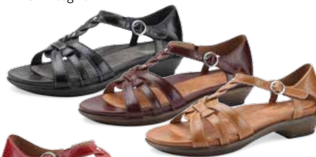
Calliope women's 36-42 (US 6-12) Red Glazed Full Grain Black Glazed Full Grain Chocolate Glazed Full Grain Toast Glazed Full Grain