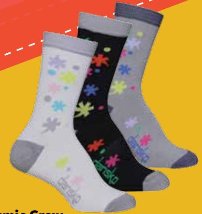
Cosmic Crew women's Merino Wool Grey Black White