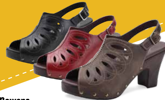
Rowena women's 36-42 (US 6-12) Black Full Grain Red Full Grain Brown Crazy Horse

Make time to capture the special moments. Like good friends and good shoes, they keep you going through life's ups and downs. Dansko shoes provide support and all day comfort so try a pair and see what develops.