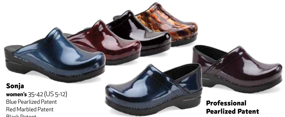
Sonja women's 35-42 (US 5-12) Blue Pearlized Patent Red Marbled Patent Black Patent Tiger's Eye Patent

"Mommy and me" styles available see pg 25.