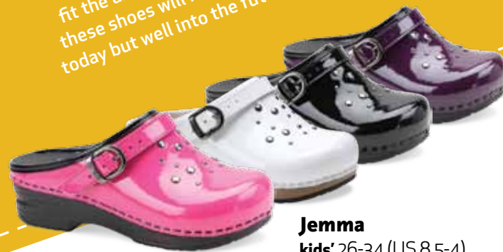
Jemma kids' 26-34 (US 8.5-4) Bubblegum Patent White Patent Black Patent Purple Patent