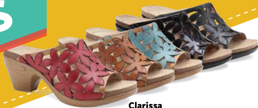
Clarissa women's 36-42 (US 6-12) Red/Biscotti Full Grain Amber/Biscotti Full Grain Dutch Blue/Biscotti Full Grain Black Patent Black Full Grain