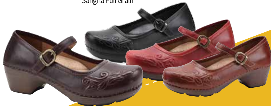
Savanna women's 36-42 (US 6-12) Chocolate Full Grain Black Full Grain Crimson Veg-Tan Saddle Full Grain