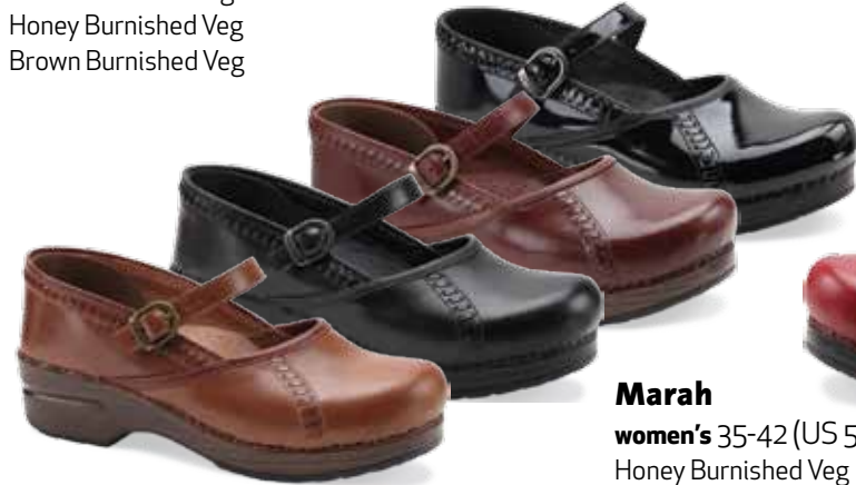
Marah women's 35-42 (US 5-12) Honey Burnished Veg Black Burnished Veg Brown Burnished Veg Black Patent Ruby Burnished Veg