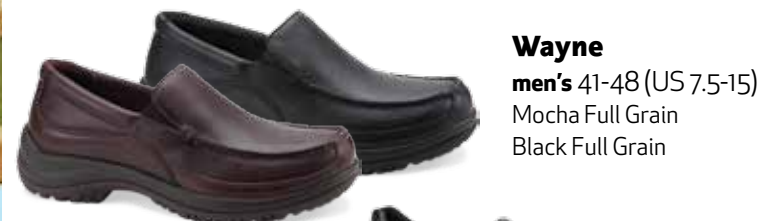
Wayne men's 41-48 (US 7.5-15) Mocha Full Grain Black Full Grain