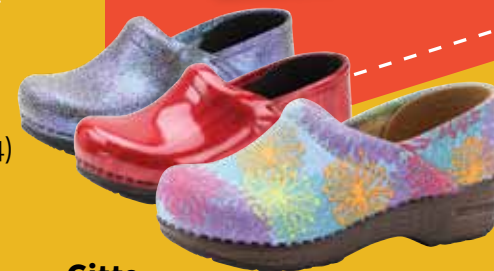
Gitte kids' 26-34 (US 8.5-4) Iridescent Blue Shagreen Red Eelskin Patent Blue Starburst