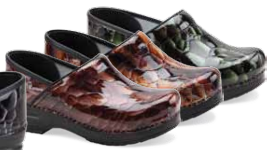
Professional Tiger's Eye women's 35-43 (US 5-13) Onyx Tiger's Eye Patent Almandine Tiger's Eye Patent Tiger's Eye Patent Emerald Tiger's Eye Patent