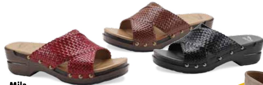
Mila women's 35-43 (US 5-13) Ruby Burnished Veg Honey Burnished Veg Black Burnished Veg