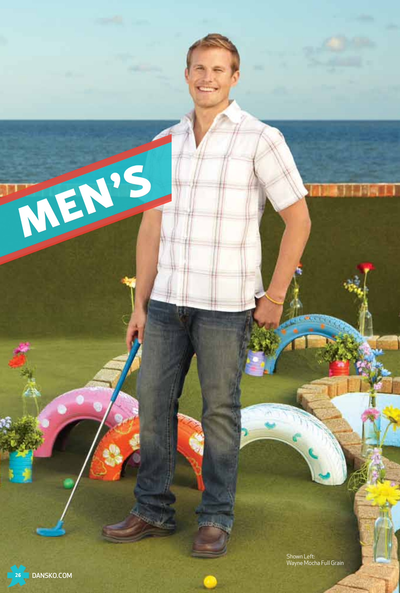
Shown Left: Wayne Mocha Full Grain

* JOIN THE CLUB Do you play for fun or keeps? Either way, there's a pair of Dansko shoes for you. No membership required, just a love of great style and quality. Slip on a pair today and see how Dansko comfort keeps you in the swing of things.