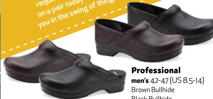
Professional men's 42-47 (US 8.5-14) Brown Bullhide Black Bullhide More styles and colors available at Dansko.com

* JOIN THE CLUB Do you play for fun or keeps? Either way, there's a pair of Dansko shoes for you. No membership required, just a love of great style and quality. Slip on a pair today and see how Dansko comfort keeps you in the swing of things.