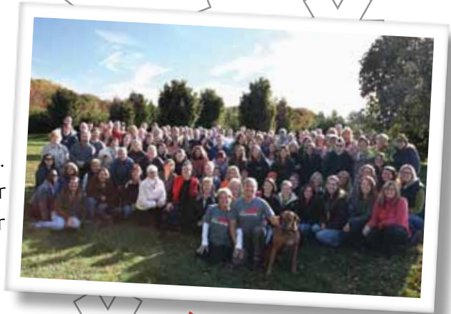
The Dansko team

Throughout this book you'll find a dozen more places we seek inspiration—from nature to our families to gorgeous shoes. Hopefully one of them will inspire you or at least make you happy. Enjoy.