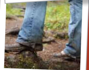
My Arcadia clogs are perfect for exploring

Kiki SLIP RESISTANT women's 35-43 (US 5-13) Chocolate Waterproof Nubuck Wine Waterproof Nubuck Charcoal Waterproof Nubuck Black Full Grain