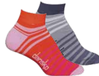
Awning Stripe Ankle women's COOLMAX® EcoMade Pink Grey (Also available in Blue and Purple)