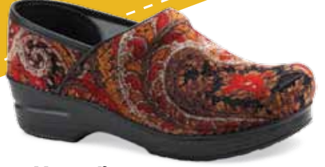
Vegan Pro women's 36-42 (US 6-12) Black Striped Multi Striped Brown Tapestry Blue Tapestry Rust Tapestry Red Tapestry