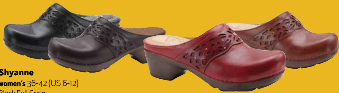
Shyanne women's 36-42 (US 6-12) Black Full Grain Chocolate Full Grain Crimson Veg-Tan Saddle Full Grain