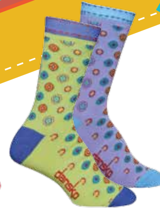
Orbit Crew women's COOLMAX® EcoMade Jalapeno Lavender (Also available in Black and White)