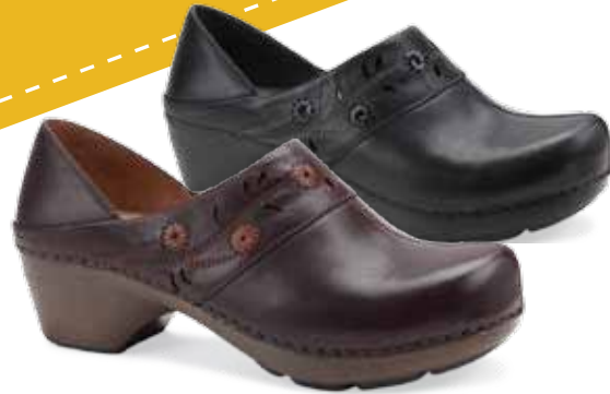
Summer women's 35-43 (US 5-13) Chocolate Full Grain Black Full Grain