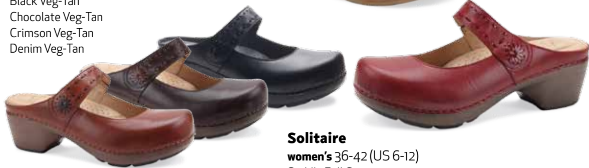
Solitaire women's 36-42 (US 6-12) Saddle Full Grain Chocolate Full Grain Black Full Grain Sangria Full Grain