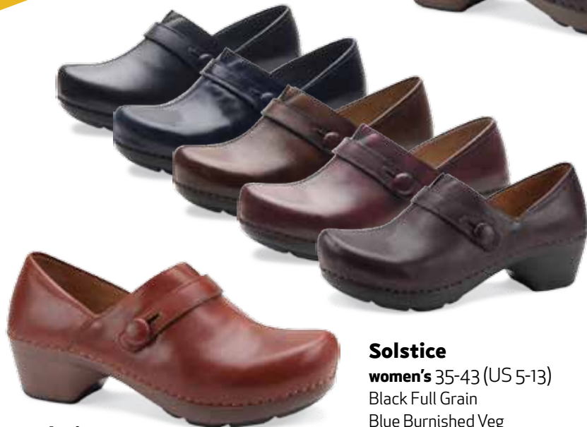
Solstice women's 35-43 (US 5-13) Saddle Full Grain