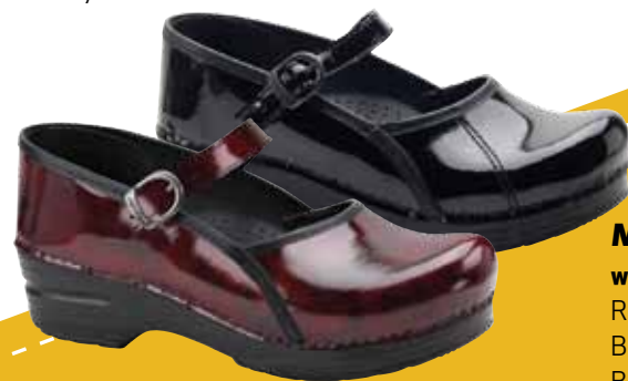
Marcelle women's 35-42 (US 5-12) Red Marbled Patent Black Patent Black Cabrio* Hickory Cabrio Cordovan Cabrio *Also available in size 43 (US 13)