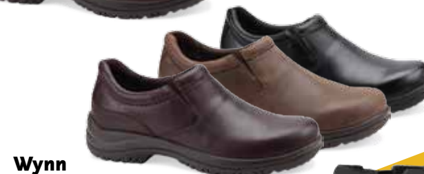
Wynn men's 41-48 (US 7.5-15) Mocha Full Grain Brown Distressed Black Smooth