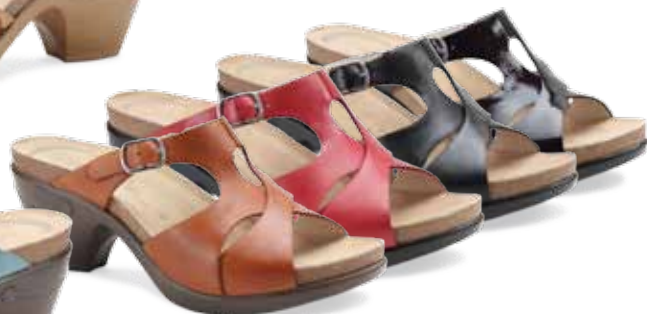
Cai women's 36-42 (US 6-12) Dutch Blue Grain Amber Full Grain Red Full Grain Black Full Grain Black Patent