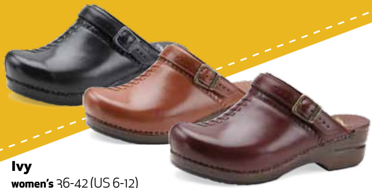
Ivy women's 36-42 (US 6-12) Black Burnished Veg Honey Burnished Veg Brown Burnished Veg