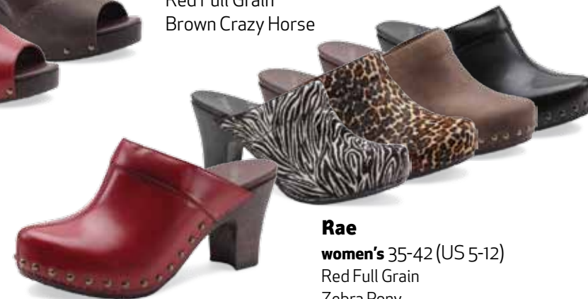
Rae women's 35-42 (US 5-12) Red Full Grain Zebra Pony Leopard Pony Brown Crazy Horse Black Full Grain