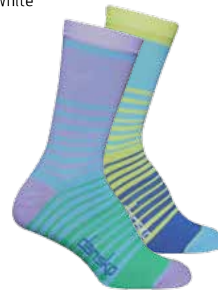
Awning Stripe Crew women's COOLMAX® EcoMade Blue Purple (Also available in Pink and Grey)