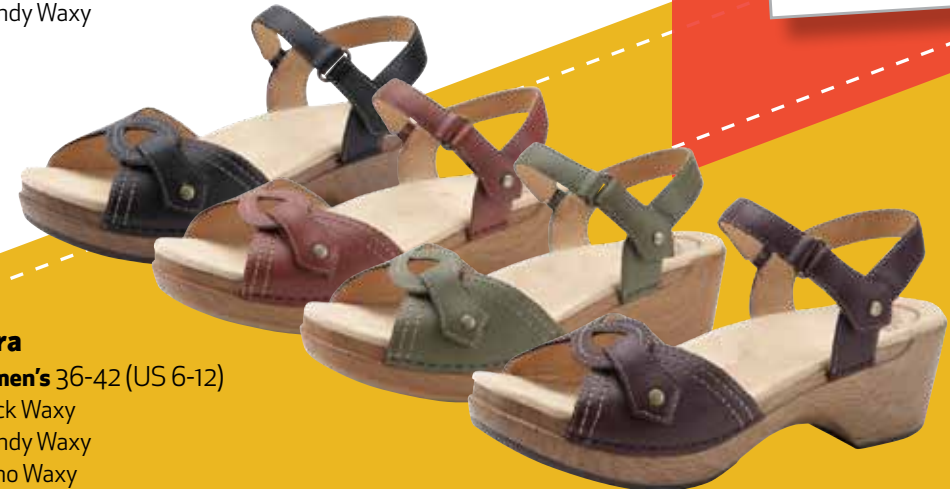
Sara women's 36-42 (US 6-12) Black Waxy Brandy Waxy Chino Waxy Java Waxy