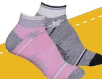
Galaxy Ankle women's Merino Wool Grey Orchid (Also available in crew length)