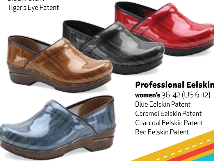
Professional Eelskin Patent women's 36-42 (US 6-12) Blue Eelskin Patent Caramel Eelskin Patent Charcoal Eelskin Patent Red Eelskin Patent