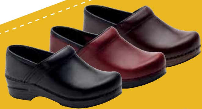
Professional Pull-up women's 35-43 (US 5-13) Black Pull-up Crimson Pull-up Brown Pull-up* Indigo Pull-up *Also available in Wide Pro