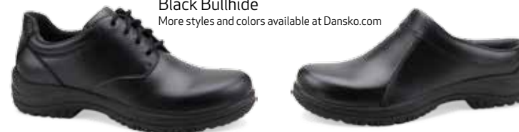
Walker men's 41-48 (US 7.5-15) Black Smooth