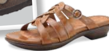
Distressed Leathers & Nail heads