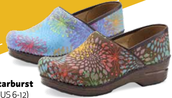
Vegan Pro Starburst women's 36-42 (US 6-12) Blue Multi Canvas Brown Multi Canvas

* ROCK DON'T ROLL Whether you're hard at work or working hard at play, you'll hit the jackpot in Dansko shoes. They're designed with a unique rocker bottom for energy return, great stability and all day comfort. See how much fun rock without the roll can be.