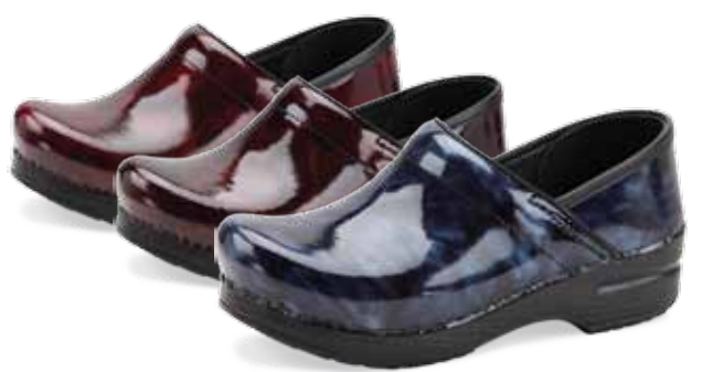
Professional Marbled Patent women's 35-42 (US 5-12) Red Marbled Patent Brown Marbled Patent Blue Marbled Patent