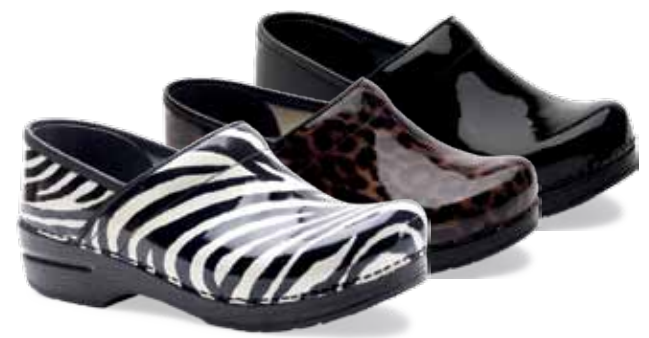
Professional Patent women's 36-42 (US 6-12) Zebra Patent Leopard Patent* Black Patent* *Also available in size 35 & 43 (US 5 & 13). Black Patent available in Narrow & Wide Pro