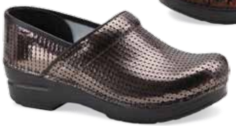
Professional Sequins women's 35-43 (US 5-13) White Gold Sequins