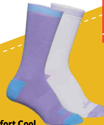
Comfort Cool women's COOLMAX® EcoMade Lavender Grey (Also available in black and grey)