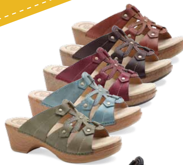
Serena women's 35-43 (US 5-13) Chino Waxy Turquoise Waxy Sangria Waxy Java Waxy Brandy Waxy Black Waxy