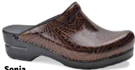
Sonja women's 35-42 (US 5-12) Brown Tooled Black Tooled Antique Brown Oiled Black Oiled Cordovan Cabrio Black Cabrio Hickory Cabrio