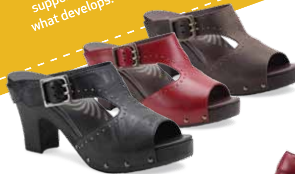
Ripley women's 36-42 (US 6-12) Black Full Grain Red Full Grain Brown Crazy Horse