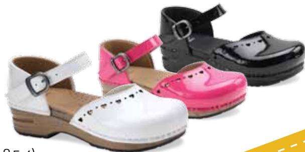
Jamie kids' 26-34 (US 8.5-4) White Patent Bubblegum Patent Black Patent