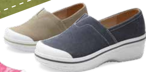
Vesta kids' 26-34 (US 8.5-4) Pink Floral Purple Tie Dye Pink Tie Dye Sand Canvas Navy Canvas