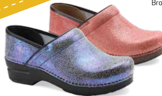
Professional Shagreen women's 36-42 (US 6-12) Iridescent Blue Shagreen Terracotta Shagreen