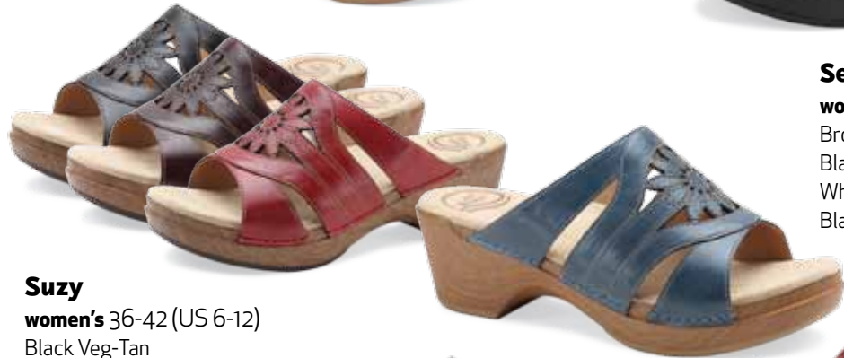
Suzy women's 36-42 (US 6-12) Black Veg-Tan Chocolate Veg-Tan Crimson Veg-Tan Denim Veg-Tan