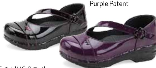
Jada kids' 26-34 (US 8.5-4) Black Patent Purple Patent